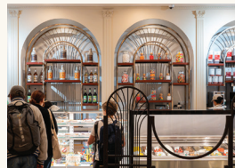
Upper East Side