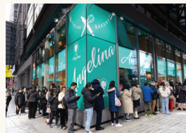
7 Time Square