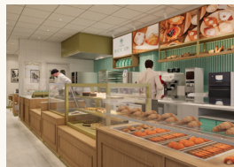
Fort Lee, NJ